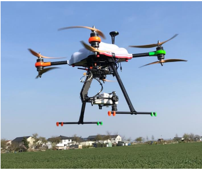
FireflEYE 185 onboard RTK-X8